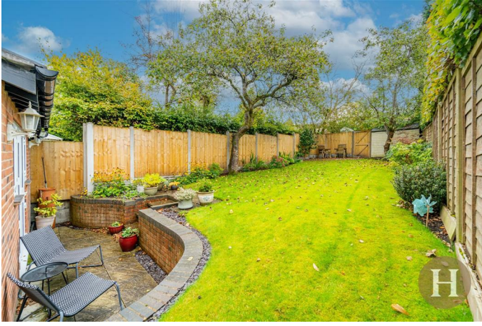
Laid patio area with steps rising to the well maintained lawn and side patio area